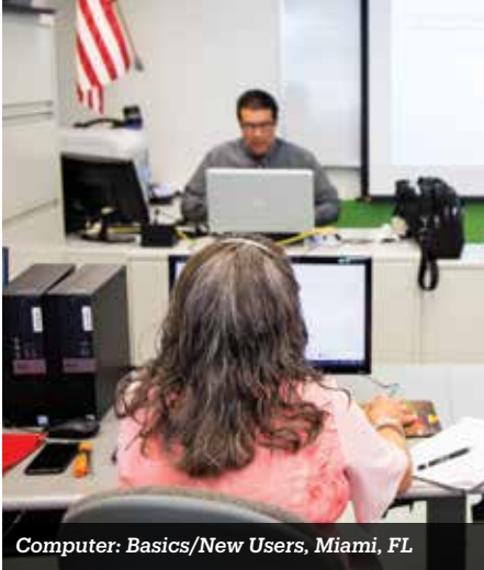
Computer: Basics/New Users, Miami, FL